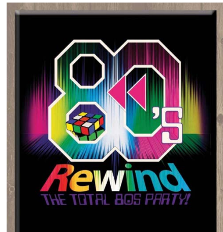
Table bookings/tickets available at finance office