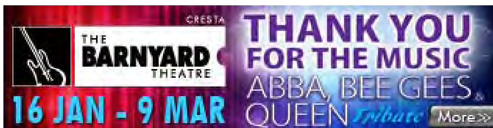
Table bookings/tickets available at finance office – Rina La Grange

Date: 8 March 2014 Show: Thank you for the music – ABBA, Bee Gees & Queen Time: Show starts at 20:00 (doors open at 18:30) Price: R150 p/p Contact person: Rina La Grange